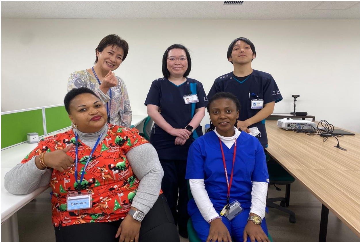
NP INCHARGE AND THE TEAM FROM